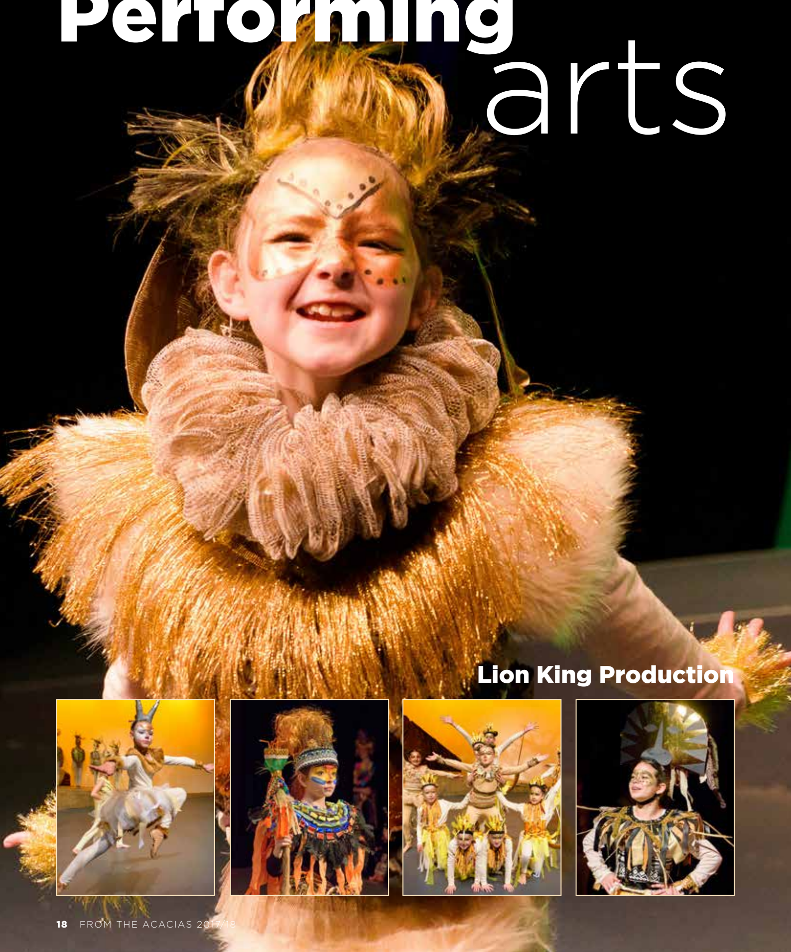
Lion King Production